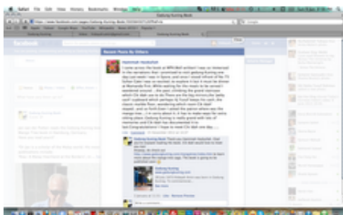
Screen shot 2013-06-09 at 20.08.34.png 480K